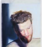
Niklas Holmgren, Orden VI/The Words VI (Face with Shadow) , 2022 Oil on canvas, 47 x 40 cm