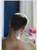
Niklas Holmgren, Orden V/The Words V (Neck) , 2022 Oil on canvas, 68 x 47 cm