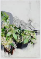
Niklas Holmgren, Orden III/The Words III (Bird Cherry) , 2022 Oil and pencil on canvas, 81 x 56 cm