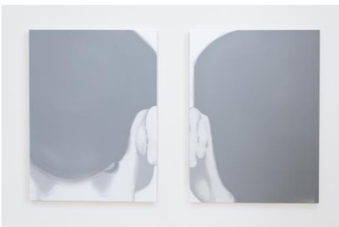
Jwan Yosef, Untitled , 2022 Oil on canvas, 101 x 76 (x2) cm