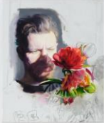
Niklas Holmgren, Orden II/The Words II (Tulip) , 2022 Oil and pencil on canvas, 57 x 47 cm