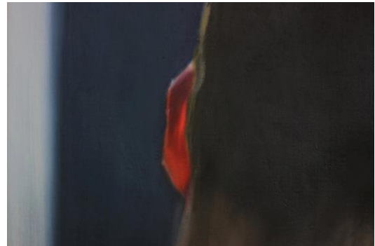
Detail from one of the paintings in the series Orden, (The Words) 2022, by Niklas Holmgren

Holmgren paintings capsule the intimate moments where time, the here and now, becomes endless. The brushstrokes capture the delicate properties of skin, flesh, and blood with ease. The light sipping through the ears, or illuminating the hands that rest in the book, echoes of what is outside of the canvas, the unspoken. The imagery together composes what seems to be a secret overture.