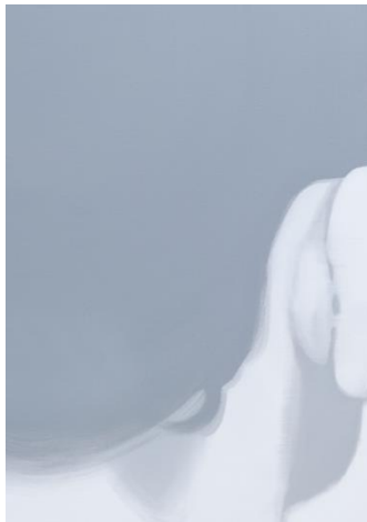
Detail from Untitled, 2022, by Jwan Yosef

Yosef uses the brushstrokes in gray, misty shades, to layer the surface that creates a three-dimensional sculptural effect and a reductive style. The motif comes near the viewer and is not only blown up but also cropped very tightly, and the back of the heads seem to almost burst the canvas. The two persons' ears are so close to each other but are still separated, nearly severed as if they were at one point part of the same body. As if there is an imminent need to get closer and closer in a dance of seduction and desire.